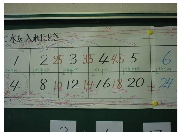
Pic. 4 Symbolized Table

Pupils also found the defining character of proportion: conservation of sum. At the sixth hour, the teacher posed more difficult problem. The problem was, “when a value is 2.5dl, the other value is 3cm, and when a value is 6.5dl, the other value is 7.8cm, then when a value is 9dl, what cm is the other value? When a table became a symbol, it was possible to detect properties here and there, and acquired data that are not in the hand (Pic. 4).