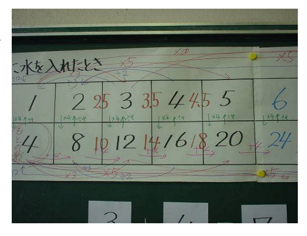
Pic. 4 Symbolized Table