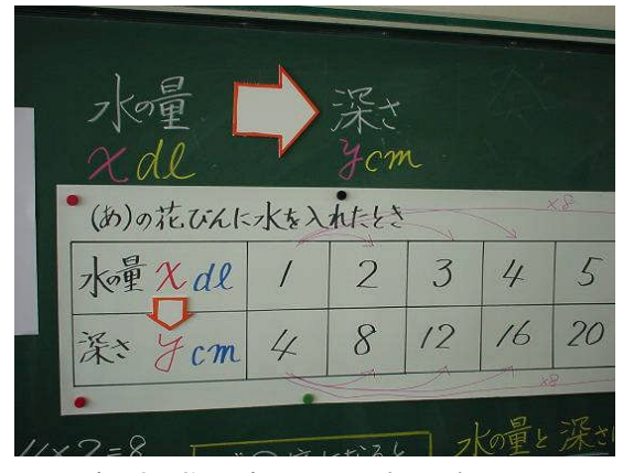
Pic.2 Semi-general Rule

explanation was "sum would correspond to sum", but the pupils did not seem to understand. Also the explanations of external ratio and of internal ratio were made. Thus, the calculation procedure of pupils was brought to the fore to acquire the answer 32 by using an individual number, but they did not explain the general rule but replied only the calculation procedure or fragmentary rule using a specified pair of values and lacked generality.